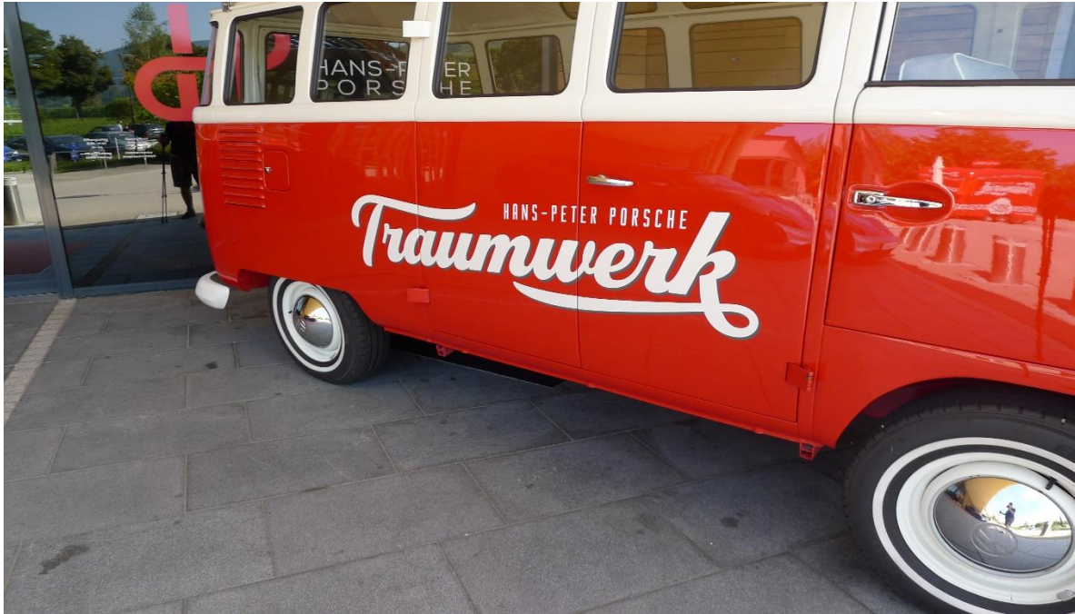
Hans-Peter Porsche TraumWerk is a unique museum