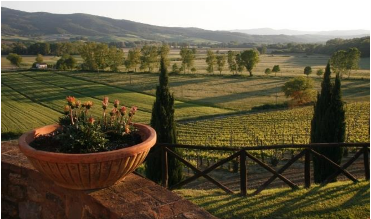
Casali di Bibbiano looking to Montalcino