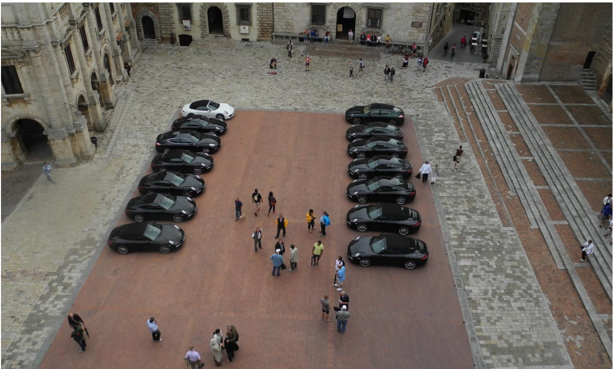
NO CARS ALLOWED ON PIAZZA GRANDE!! (Except for Fast Lane Travel!!)