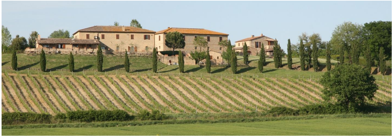
Casali di Bibbiano in Buonconvento