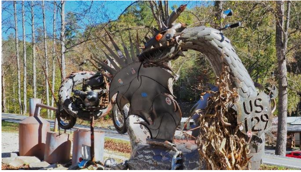
Carolina Colors and Tail of the Dragon: 58 th Annual Moonshine Festival 2025. Come with us!