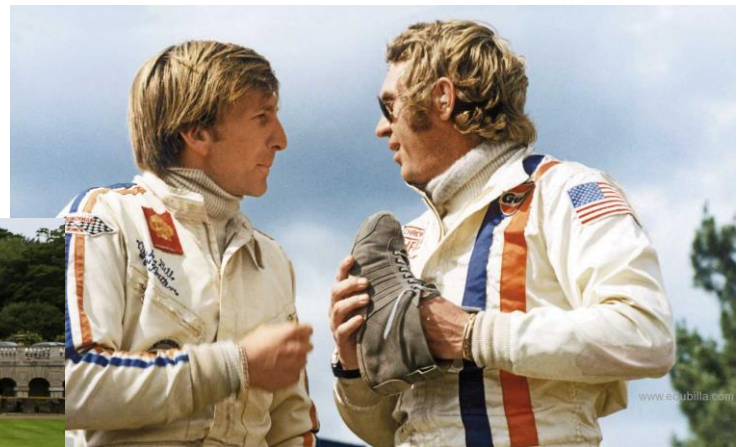
Derek Bell & Steve McQueen