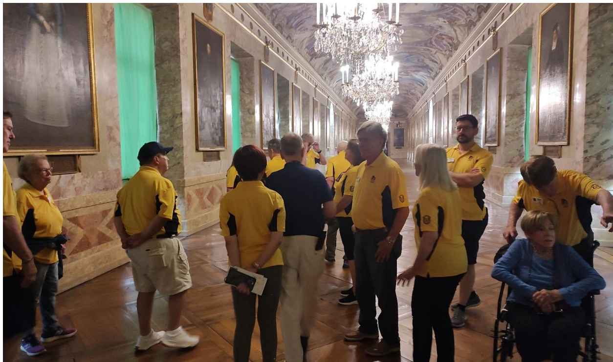
The Great Hall of Castle Ludwigsburg