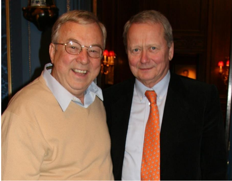
Wolfgang Porsche and I at the Sacher Hotel in Vienna in 2009