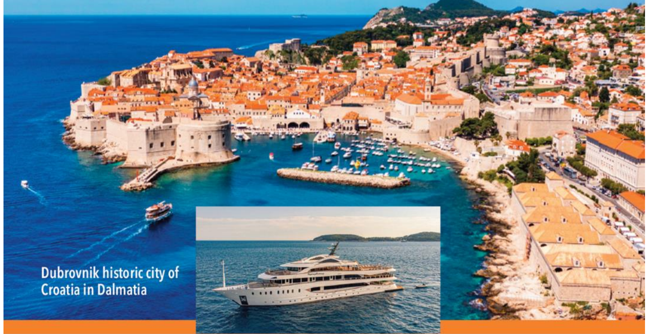
Dubrovnik historic city of Croatia in Dalmatia