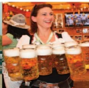
Carls Brauhaus Dinner/ Stuttgart