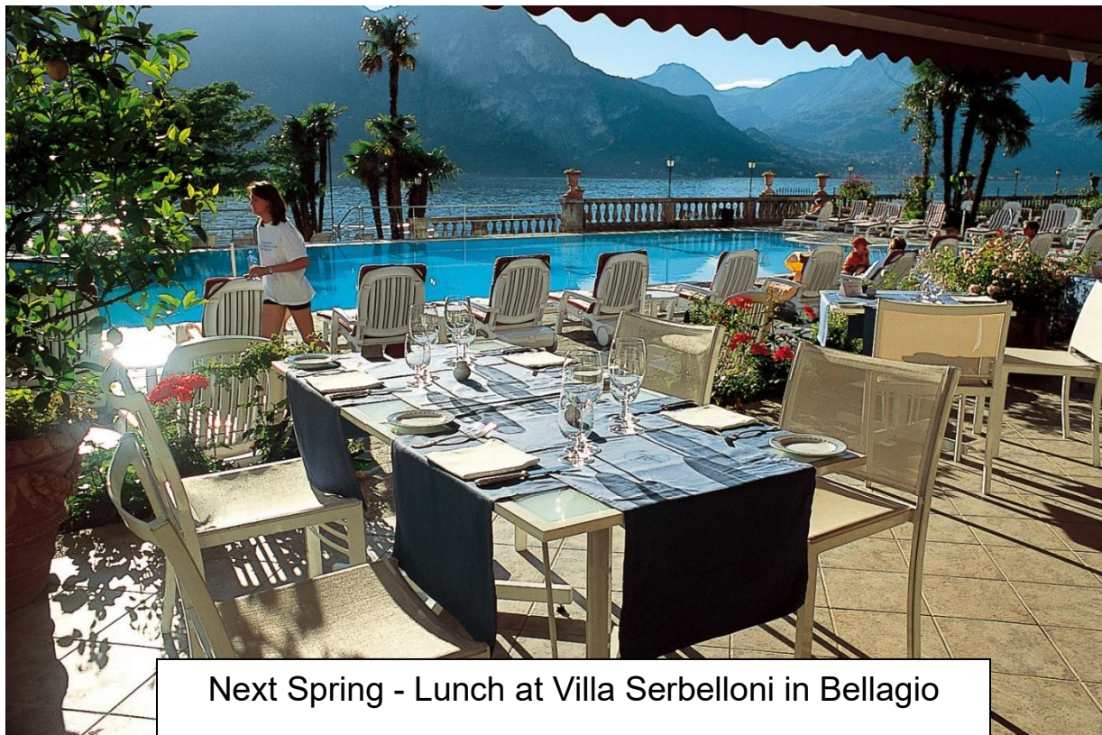
Next Spring - Lunch at Villa Serbelloni in Bellagio

But according to Freitag, there's yet another level of bifurcation happening at the high end. "There's luxury, then there's ultraluxury," he said. "Clearly, for the ultraluxury properties, there is no limit. There's just the customer saying, 'I want what I want, when I want it, and yes, I'm willing to pay for it.'"