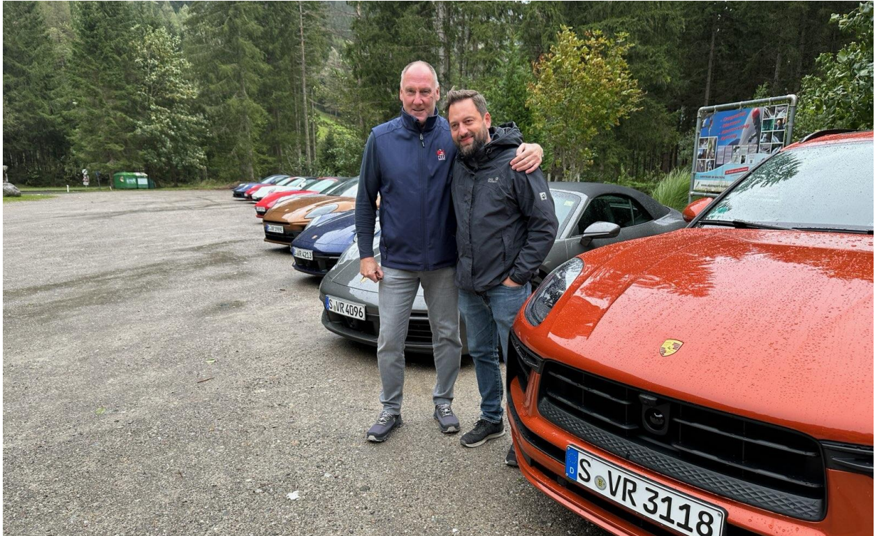
The awesome European Team