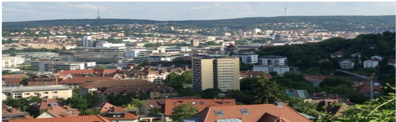
The view from the Porsche Family's Home in Stuttgart.