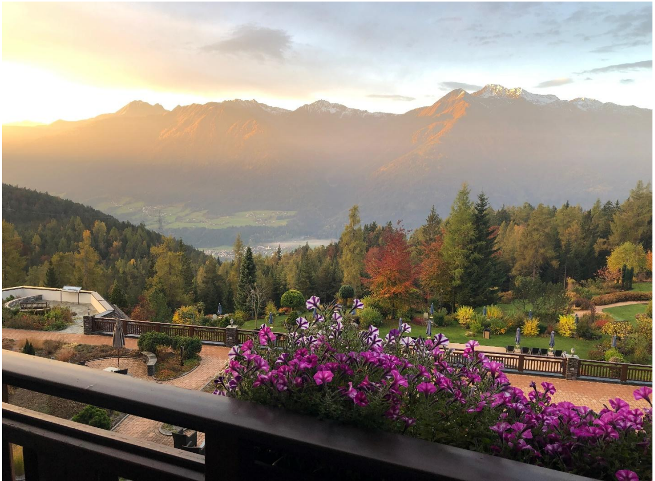
The view from the suite we have reserved for you this fall at the 5-star Interpalen: