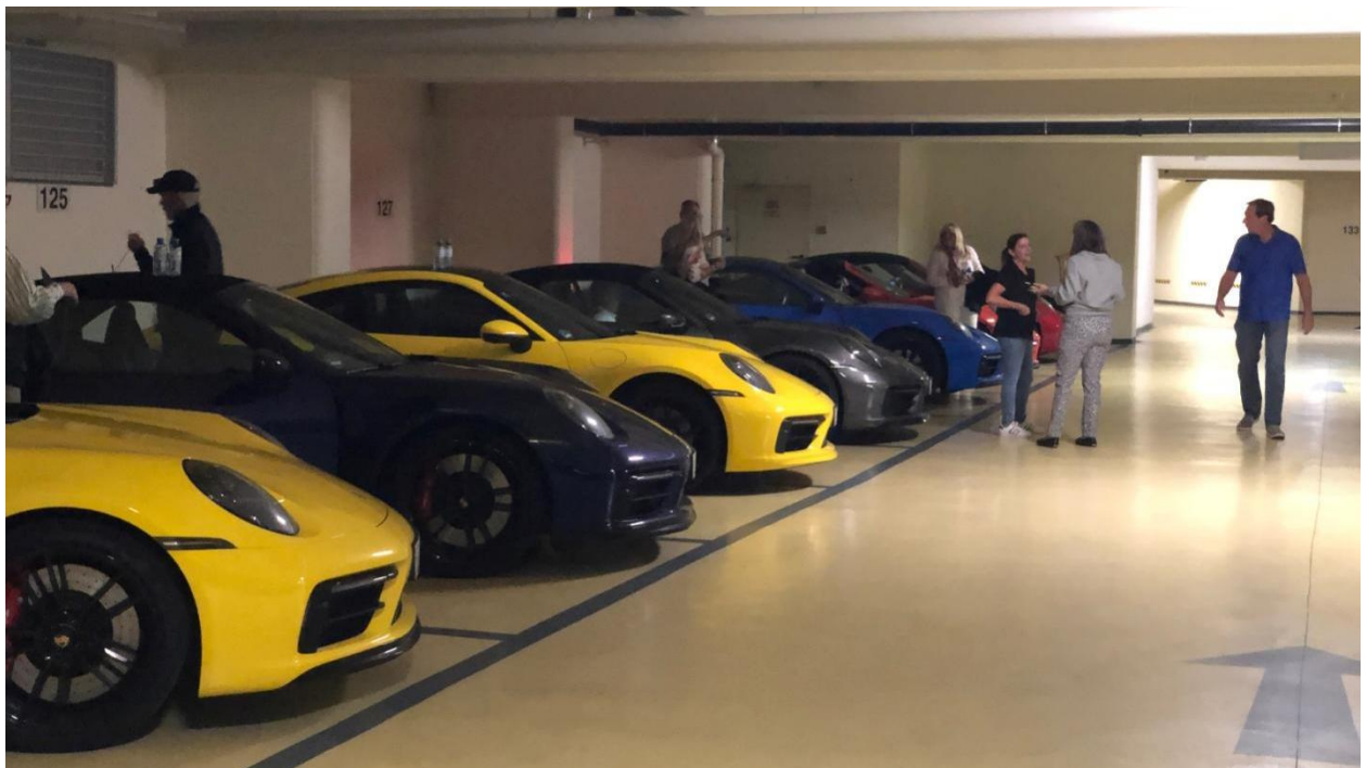
Reserved secure parking at the Interpalen: