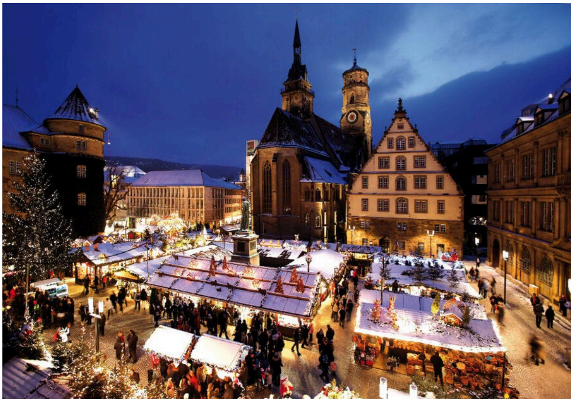
View of the Schillerplatz (Schiller Square) which is the location of the Flower Market when we are there in the spring or fall on Saturdays.