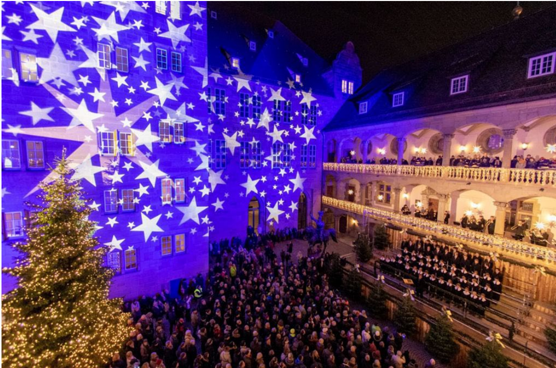
Christmas market opening in the courtyard of the Old Castle

Finally, a short note about celebrating Christmas in Germany. Unlike in the US, children here already get their presents in the evening of the 24 th (Bescherung). They are placed beneath the Christmas tree which is traditionally put up on the same day. In order to reduce stress people now put the tree up a couple days in advance. If you have a car you can drive to a Christmas tree farm and chop it on your own, but usually the tree farmers come into the cities and set up selling points on a square in each district, so that you don't have to carry it in the subway or bus.