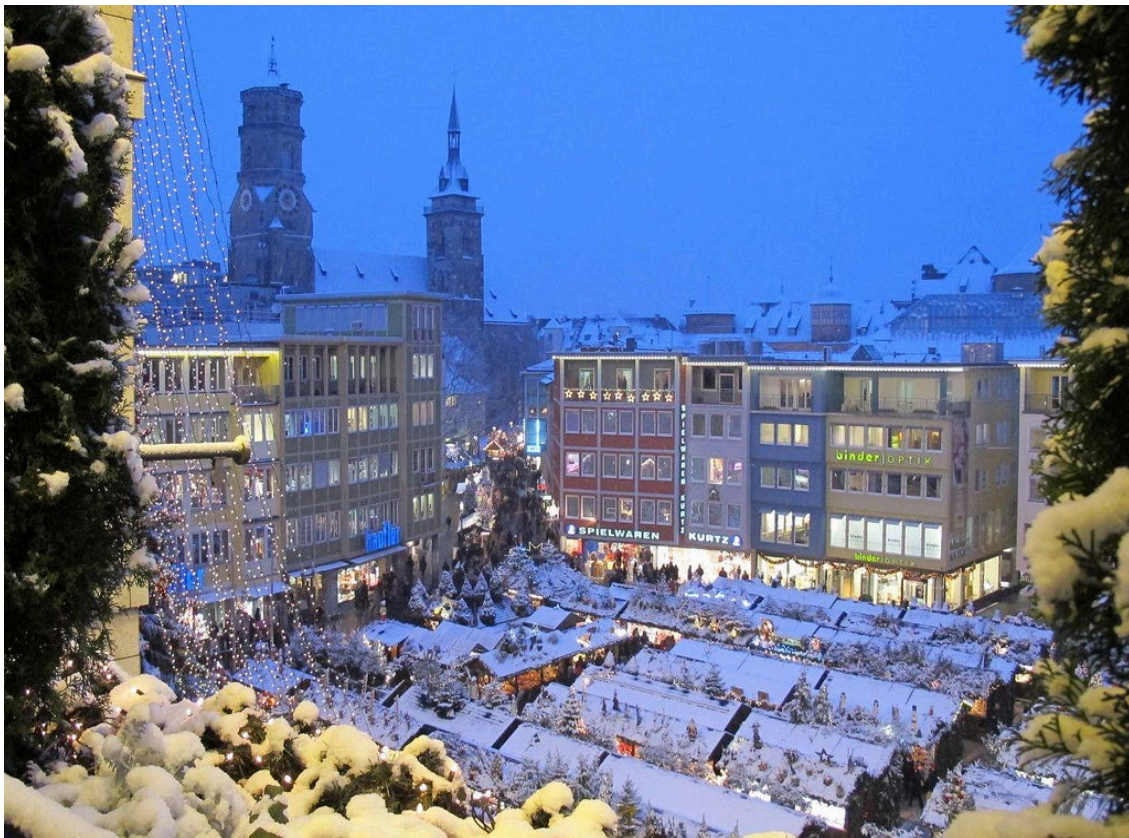
View of the Marktplatz (Market Square)