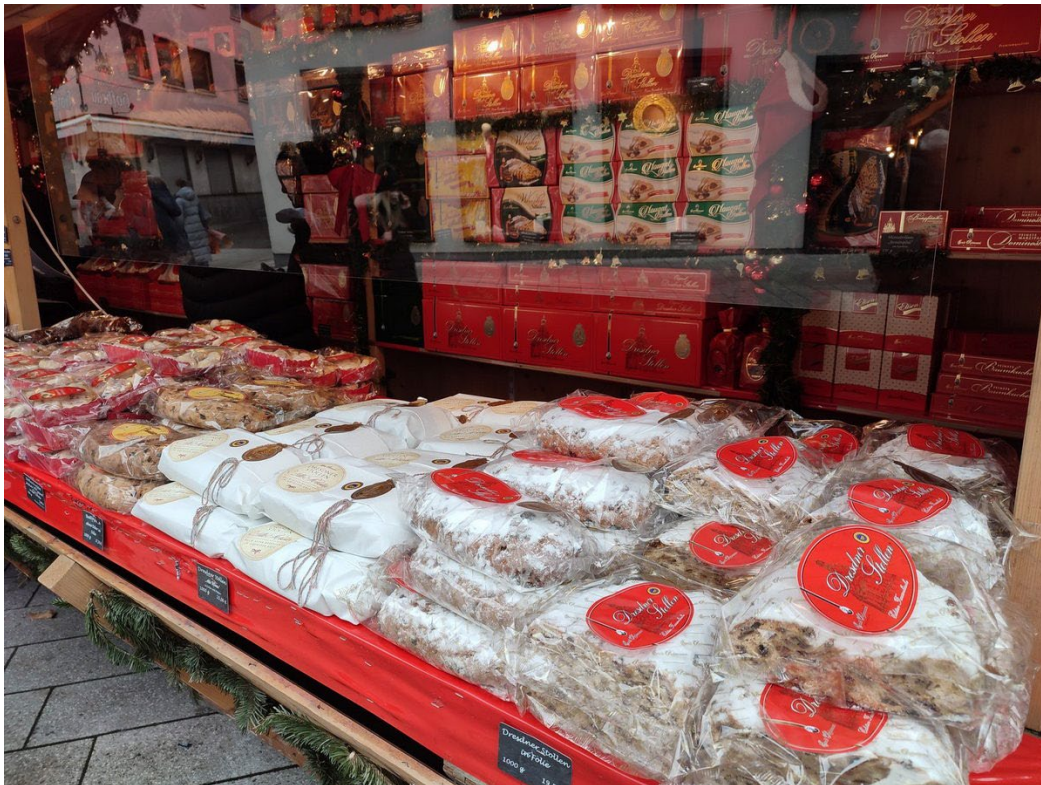
The famous Dresdner Christmas Stollen Cake . . . Fabulous