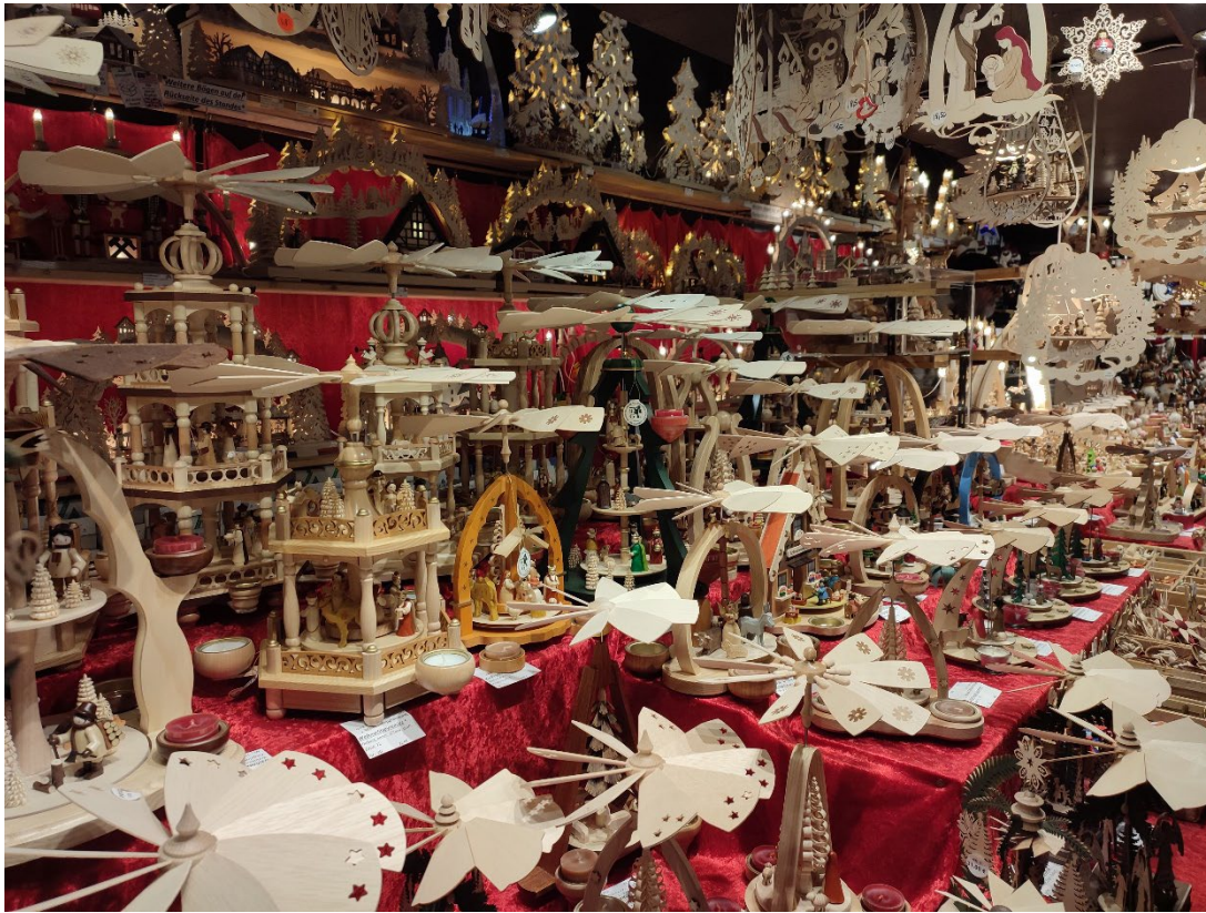
Handcrafted from the Erzgebirge Region in northern Germany.