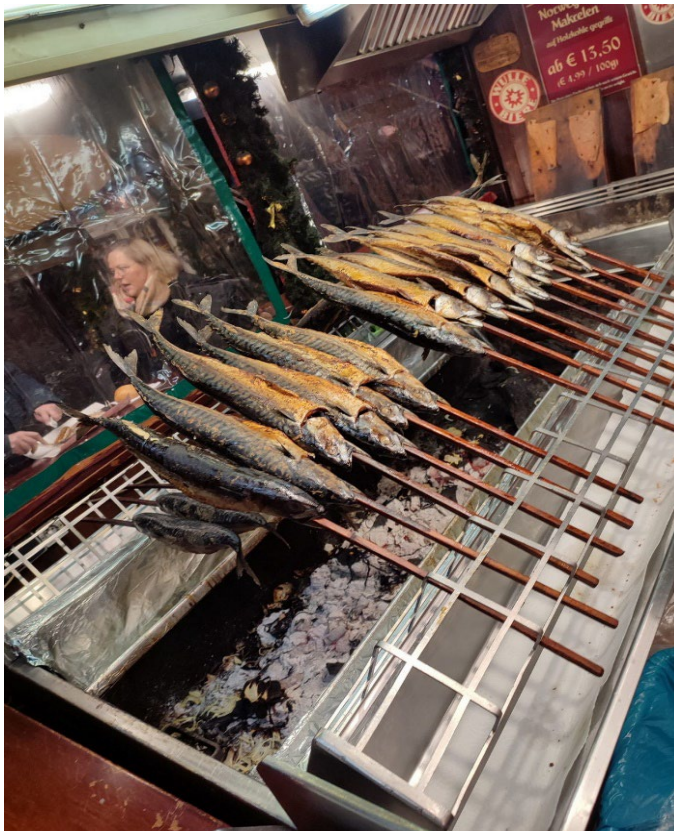
Roasted Mackerel from the North Sea

Finally, some Glühwein and the inevitable Bratwurst.