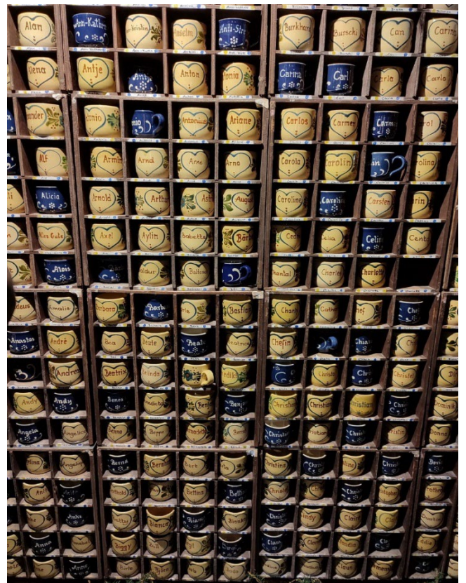
Your Glühwein Mug with your Name