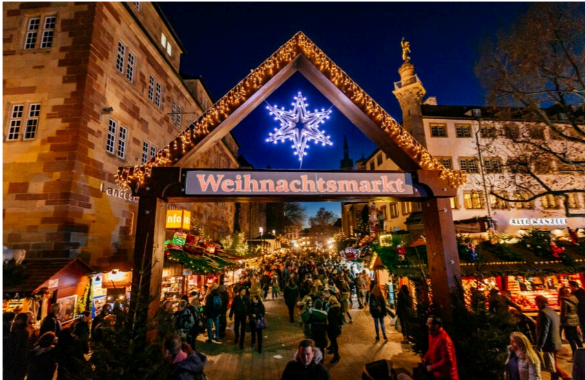
The main gate to the Stuttgarter Christmas Market.