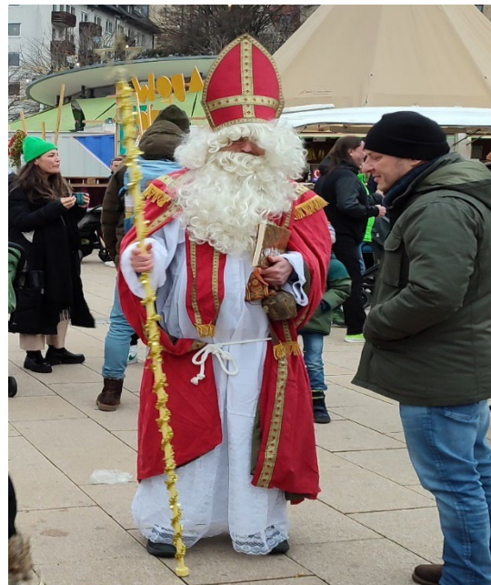
Marshmallows for the kids & St. Nicklaus, not Sant Claus, in Germany