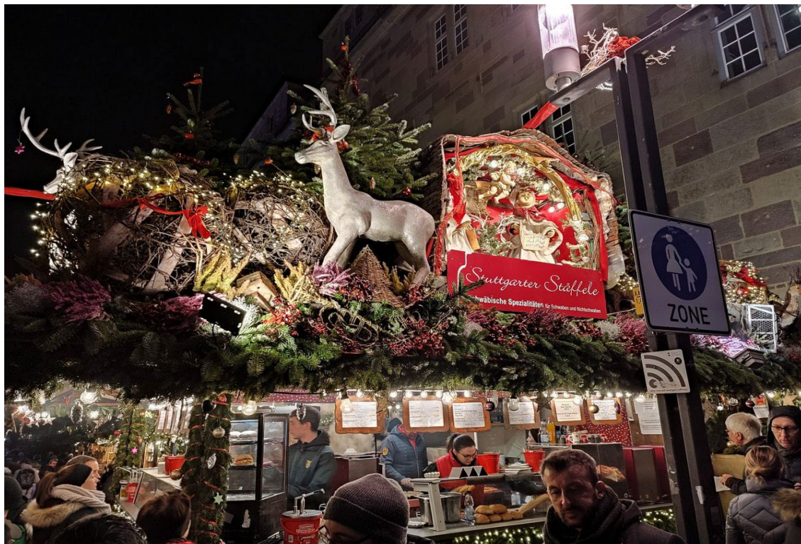
Christmas market stand of the Stuttgarter Stäffele – our favorite Restaurant.